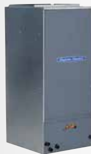
Silver SI 4FWC/H

Drop-ceiling or furr-down applications also available.