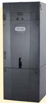
Gold XM TAM4

The Gold Series isn't just comfortable and efficient, it's quiet too. With its high-efficiency motor and precision craftsmanship, this series gives you the comfort and reliability you and your family deserve.