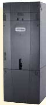
Gold XI GAM5