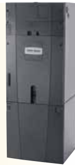
Gold SI+ GAM2