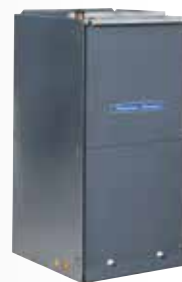
Silver SI 4FWM