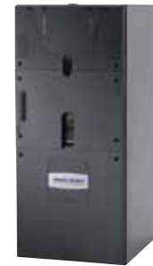
Gold SI GAF2