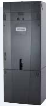
Platinum XV TAM7