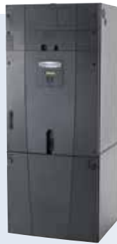
Platinum ZV TAM8

Our most innovative offering is also our most efficient. Featuring a variable-speed motor and integrated humidity control through Comfort-R™ technology, many models in our Platinum Series also include advanced communication features for a perfectly optimized matched system.